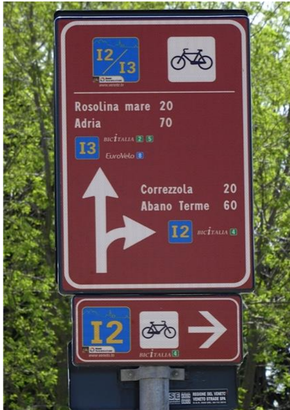
Small arrow signs