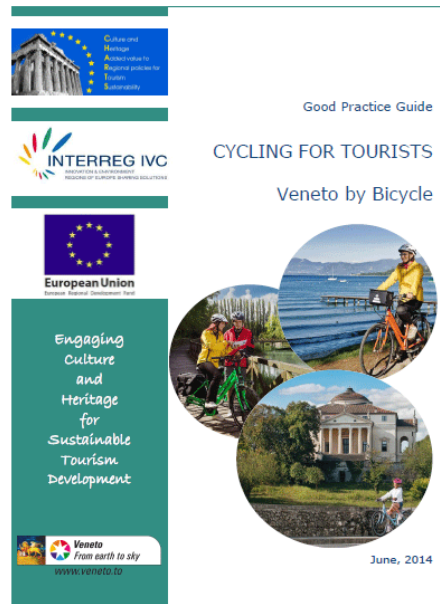
Good Practice Guide