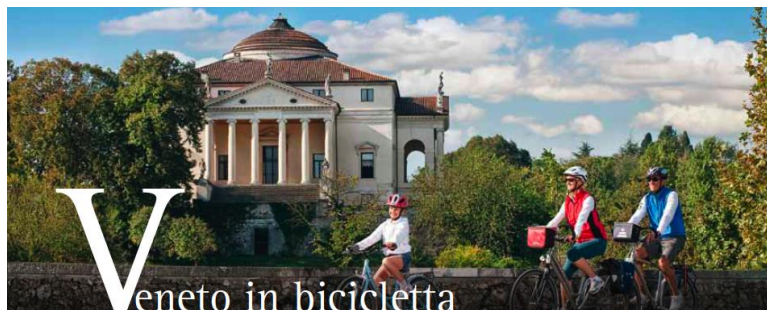
Itinerari ed escursioni.