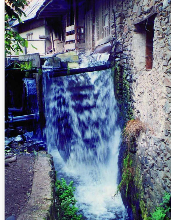
The Săliște – Gales watermill is the only watermill in Sibiu county