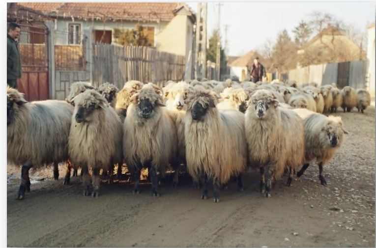
Sheep breeding represents the traditional activity in Mărginimea Sibiului

Each household (out of the 29 selected in 2007) presents itself as being a small museum, the guides and curators are the inhabitants themselves.